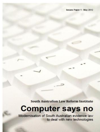
Front Cover of Issues Paper 1- 'Computer says no'

This reference was the subject of the Institute's first Issues Paper ( Computer says no ), released in May 2012 which considered the Evidence Act as it relates to telegraphic messages and computer evidence and investigated whether the Act should also provide for the admissibility of electronic communications.