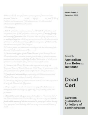
Front Cover of Issues Paper 2- 'Dead Cert'

The Institute's Issues Paper on sureties' guarantees entitled " Dead Cert: Sureties Guarantees for Letters of Administration " was approved for release by the Advisory Board in October 2012. The Issues Paper was released in early 2013, followed by a public consultation period leading to the preparation of a final report. The deadline for submissions to the Issues Paper was 8 March 2013.